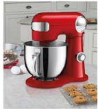
Dillard's Southpark Cuisinart 5.5 Qt Mixer Value: $250