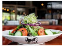
Southern Pecan Gulf Coast Kitchen Value: $100