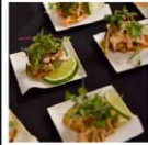
Carolina Farm Trust Private Chef Dinner for 10 at your home or the Urban Farm Value: $1,100

Event Details: March 22nd from 5-8pm at William R. Davie Park Proceeds will support Hurricane Helene relief for Western NC Tickets available online at the Facebook Event