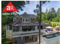
Roby Handyman Services Value: $500