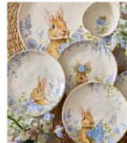
Dillard's Southern Living Bunny Plates (4) Value: $56